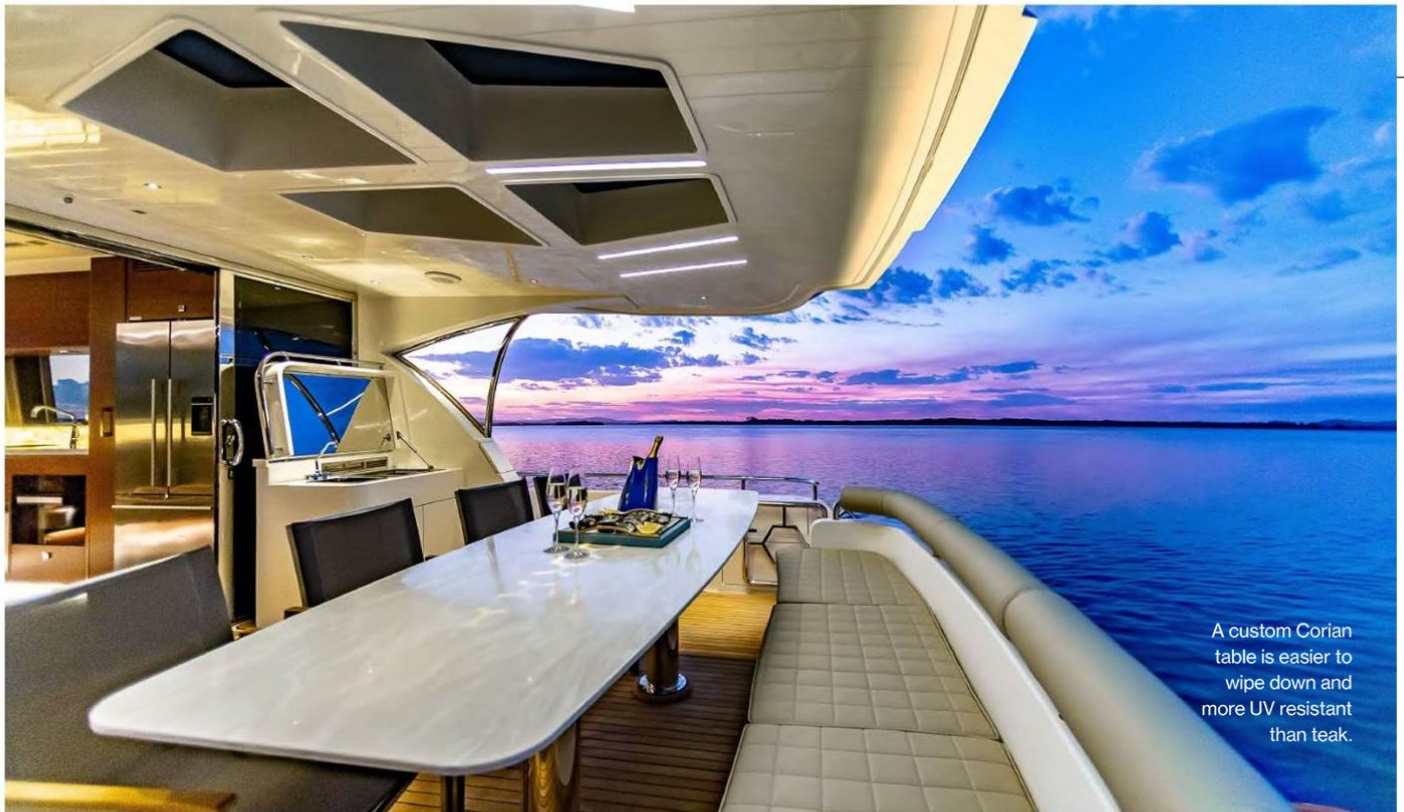
A custom Corian table is easier to wipe down and more UV resistant than teak.