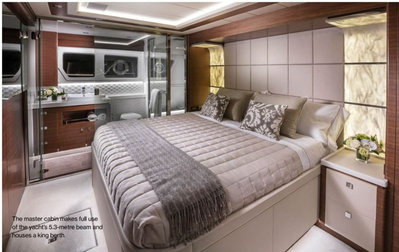
The master cabin makes full use of the yacht's 5.3-metre beam and houses a king berth.

Galley appointments include a Fisher & Paykel French door refrigerator, dishwasher and a Miele oven and cooktop that are all laid out efficiently on the starboard side of the saloon. A custom glass-topped table with Whitehaven symbols on the securing points provides the setting for either formal or relaxed gatherings.