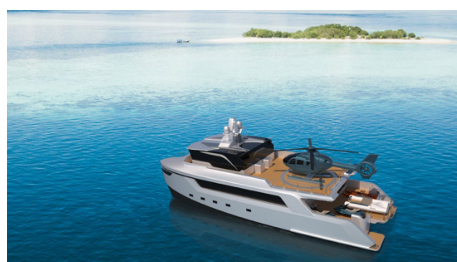
Exterior and layout design come from Misha Merzliakov Yacht Design

The catamaran yacht features a 53 square metre beach club and aft entertaining space. A variety of water toys, including multiple Jet Skis, Sea Bobs and tenders are stored on the aft deck. Once deployed, the central platform can be lowered down, transforming the stern into a “waterfront retreat”, the yard said.