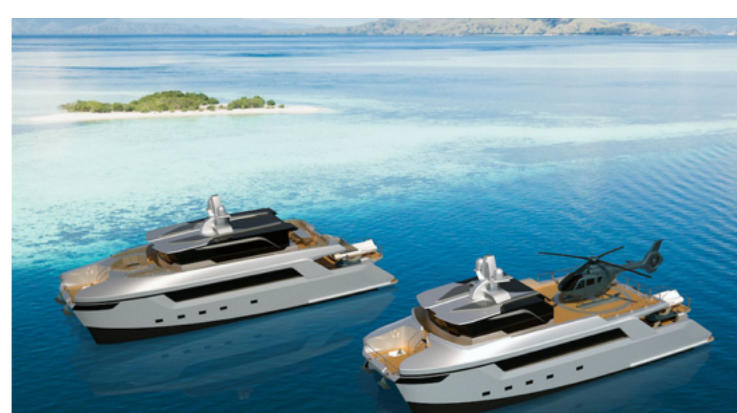
The 27 metre motor catamaran yacht and support vessel

The yard has added the duo to its recently launched “Design Collection” and revealed that development into larger models is also under works.