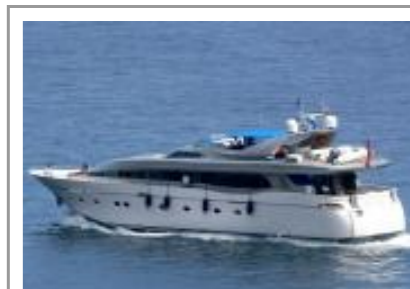
Naughty By Nature 32.1m (105.31ft) View Superyacht