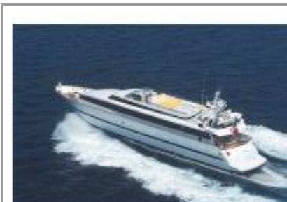
Beyond The Sea 35.4m (116.14ft) View Superyacht

Misha Merzliakov info@mishamerzliakov.com www.mishamerzliakov.com